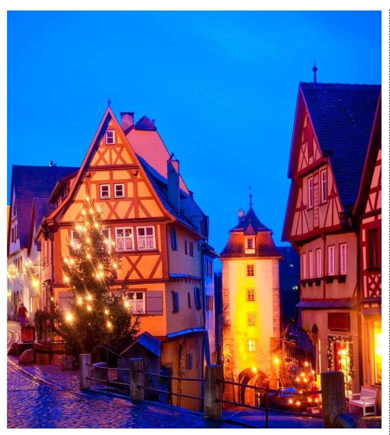
9 Days ● 19 Meals : 7 Breakfasts, 5 Lunches, 7 Dinners

HIGHLIGHTS... Würzburg, Rothenburg, Nuremberg, 6-Night Danube River Cruise, Regensburg, Passau, Choice on Tour: Passau City Walk or Veste Oberhaus Fortress, Wachau Valley, Glühwein Party, Vienna, Christmas Markets